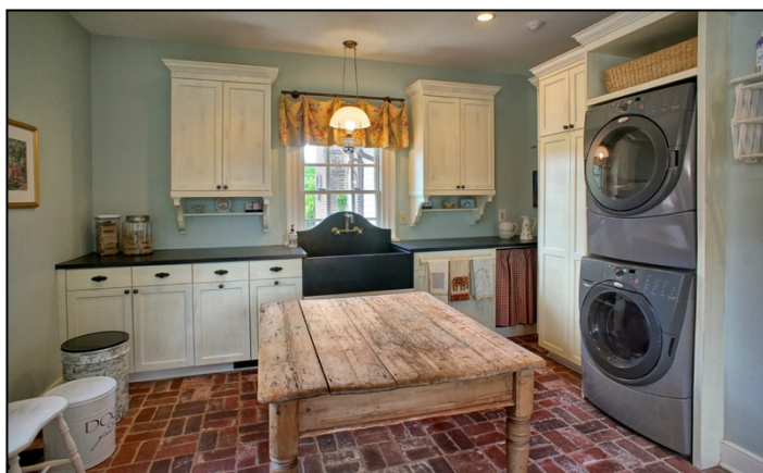
Laundry/Utility Room 16' x 13'

Brick floor; door with side lights; crown moulding and chair rail with bead board wainscoting; open to the covered back porch; doors to the powder room and utility room, open to the family room