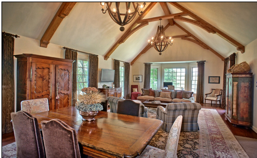
Family Room 31' x 19'

Random-width reclaimed heart pine floor; brick two-sided fireplace with arched firebox; four windows, one walk-out bay window; vaulted ceiling with stained ceiling beams; open to the kitchen and to the back entry hall